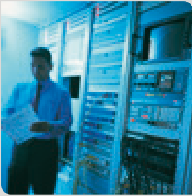
Field Force Automation