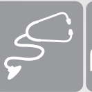
Mobile Physician Rounding