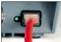
Just plug in and print

Innovative Cognitive printers lead the pack with network and mobile network ready e+Solutions. For all different size network installations where footprint and price are key factors, e+ solutions offer the most comprehensive internal ethernet ports in the industry. For applications from warehouses to hospitals, e+Solutions make network printing fast and easy.