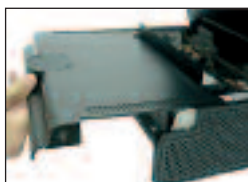
5. Easy to maintain & service Takes only 4 steps to reach the inner components.