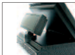
6. Customer display (VFD type 2 x 20) can be integrated to the rear of system.