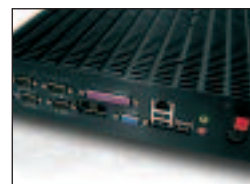
1. Rich I/O connector ports specially designed for POS