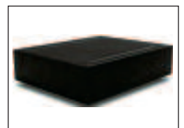
2. Dimensions: 270mm(W) x 220mm(D) x 65mm(H)

All manufacturers trademarks acknowledged. Issue 2 - 2009 Specifications may be subject to change without notice.