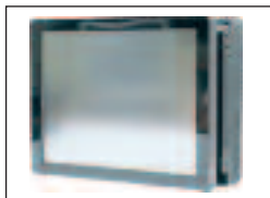
2. Wall-mount Functionality.