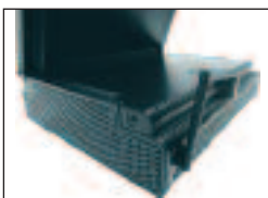
4. MSR, WiFi, Speaker, and RFID Support.