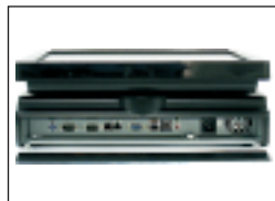
3. Easy to reach I/O connector ports.